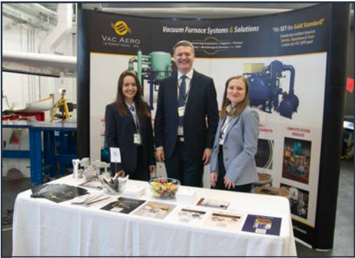
Option A + Tv