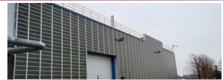
Building Panels Heat recovery to 0 C