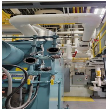
Boiler Chimney Heat recovery for Feed Water

Other opportunities: Plant & Parking wide LED re-lamping Cafeteria kitchen ventilation upgrades with air make-up